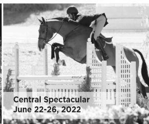
Central Spectacular June 22-26, 2022