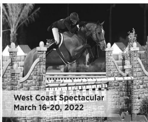
West Coast Spectacular March 16-20, 2022