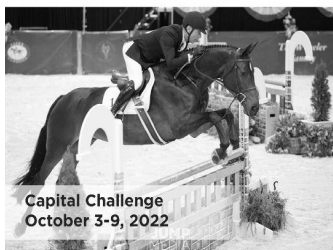
Capital Challenge October 3-9, 2022